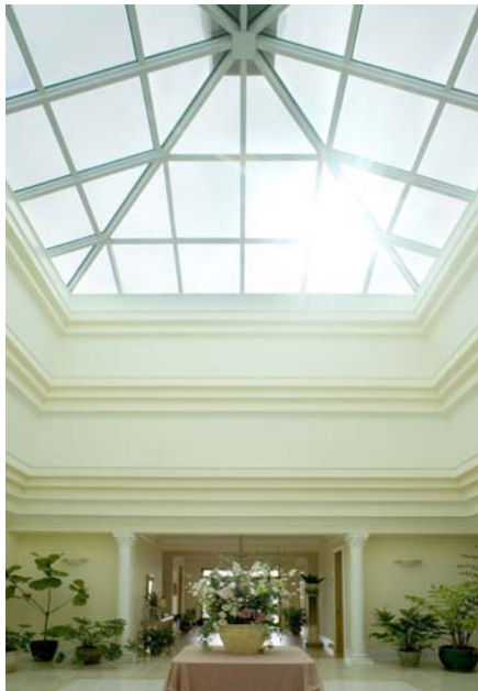
Each Vedic home has a Brahmastan, a center of silence.

Near the city's east entrance, Lipman designed a New York-style condo on the top floor of a three-story red brick commercial building. Open for touring, his home's design includes expansive prairie vistas, a variety of wall finishes, including plasters and clay and sand paints using 19th-century techniques, plus a colorful Tibetan rug collection.